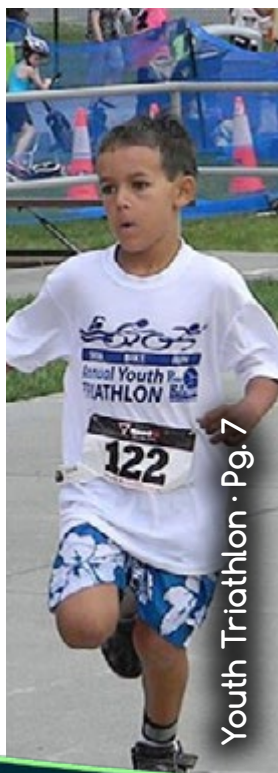
Youth Triathlon · Pg. 7

FCPRD reserves the right to photograph and videotape all activities, events, classes, programs, and facilities for promotional purposes.