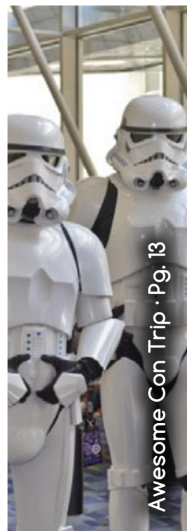
Awesome Con Trip · Pg. 13