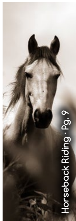
Horseback Riding · Pg. 9